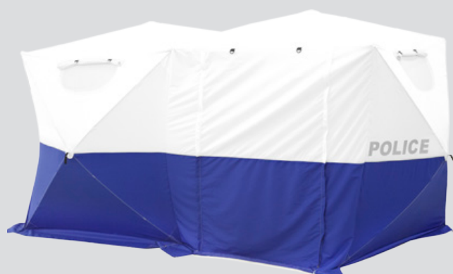
GT 210 01