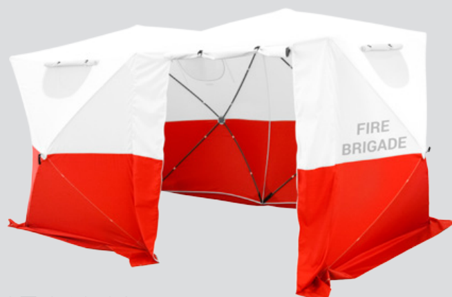
GT 210 02