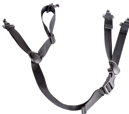
IH 000 001 000 4-point chin strap with quick release buckle