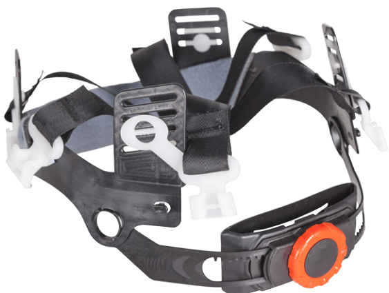
IH 000 100 000 rotatable headband