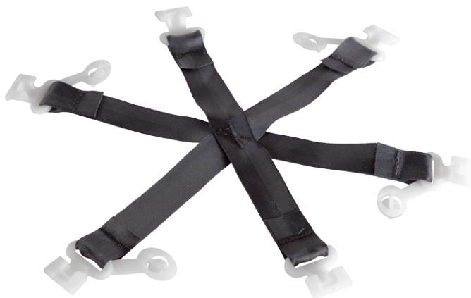
IH 000 100 020 6-point support tapes