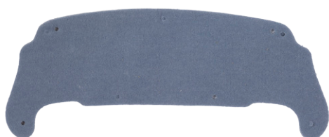
IH 000 100 080 velour sweatband