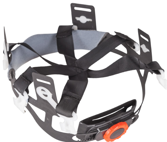
IH 000 200 000 fixed headband